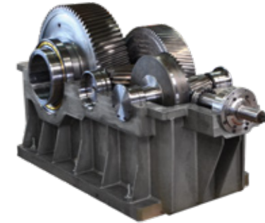
Gearbox paper industry with hollow shaft