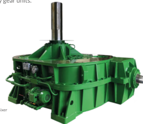
Gearbox for mixer (agitator)

Maintenance and repair from delivery and installation in your plant system - professional from a single source - also for third-party gear units.