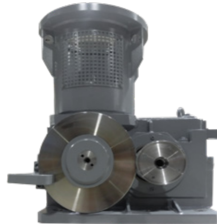
Gearbox for Paper Mill

Gearbox solutions from 2 kW - 1400 kW up to 20 t Gearboxes suitable for single drives on plants in the paper pulp and industry